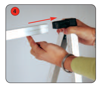
Push fit the top horizontal tubes into the 'A' frames, ensure the plastic joiners face inwards