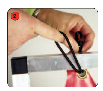
Pass the elastic bungee cord through the graphic eyelet and around the frame to secure

Corner eyelets require a bungee cord loop around the top and the side of the frame to secure