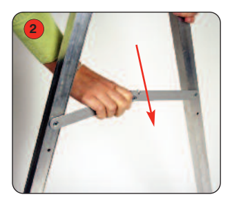
Push each locking arm down to secure the frame