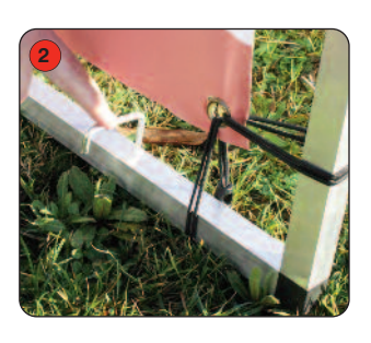
Ensure the ground peg covers the horizontal tube