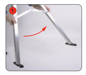
Open up all the End and Centre 'A' frames