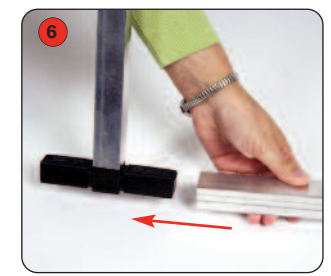
Push fit the bottom horizontal tubes into the 'A' frames, ensure the plastic joiners face inwards